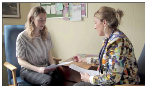
A short video introduces Enroll-HD to the Irish community, explaining what the study is for and what it involves.