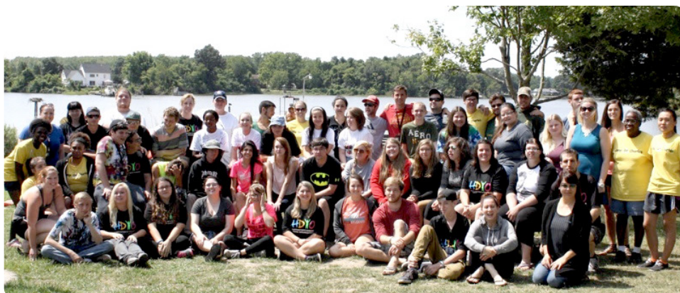
HDYO's first US youth camp in summer 2015